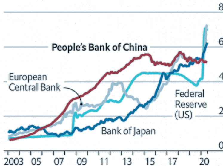
Central banks' balance-sheets, $trn